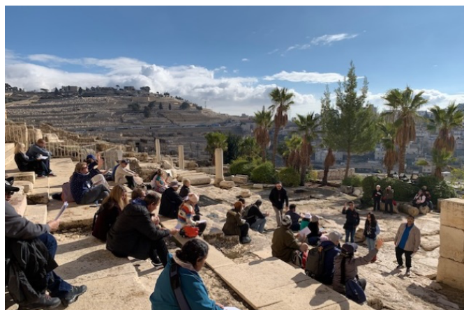
The Southern Steps with Mt of Olives in background

The days tour continues back near Temple Mount with a visit to the Davidson visitors center at the Southern wall excavations and examine some of the most important archaeological finds in Jerusalem. Discover the significance of these historical findings and how they help us understand life in Jerusalem thousands of years ago. Stand upon the Southern Steps where Jesus and His disciples walked and where Peter preached on the day of Pentecost in Acts 2.