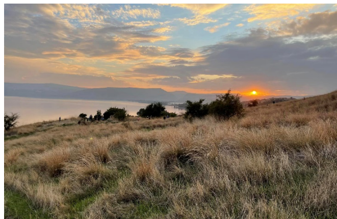
View from the Mt of Beatitudes

Ascend the peaceful Mount of Beatitudes which overlooks the Sea of Galilee and see the traditional site where Jesus preached His most famous sermon: the Sermon on the Mount.