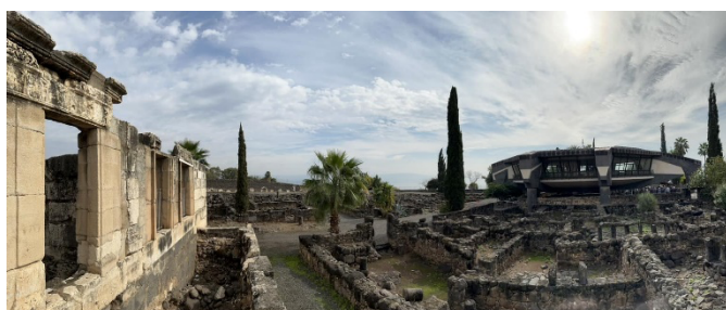
Capernaum Synagogue ruins and Peter's house

Explore Capernaum , the center of Jesus' ministry, before going to the synagogue which stands on the site where Jesus taught. Recall His teaching and preaching the gospel of the kingdom (Matthew 4:13, 23).