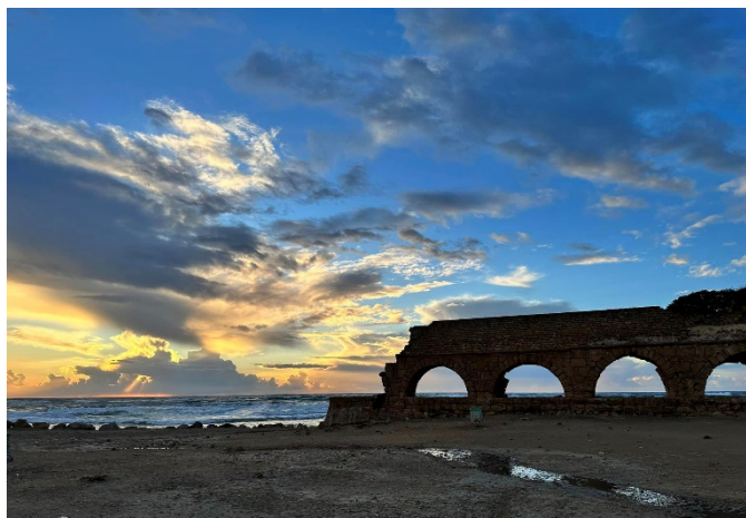
Herodian Aqueduct at Caesarea Maritima

After arriving at Ben Gurion Airport, near Tel Aviv, Israel, you will board your luxury bus for a short drive along the Coastal Plain of Sharon to Caesarea Maritima . This maritime city was built by King Herod, and was once the seat of the Roman rule. Here, Cornelius became the first gentile to convert to Christianity. This is also the location where Paul was imprisoned before his trial in Rome. View the ruins of Herod's seaside palace and a large hippodrome where chariot races were conducted.