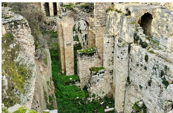
Ruins of the middle porch of the Pool of Bethesda

View the Pool of Bethesda (John 5:1-31) where Jesus performed the Sabbath miracle healing the lame man at this pool. St. Anne's Church , with incredible acoustics, is perfectly preserved and dates back to the time of the Crusades.