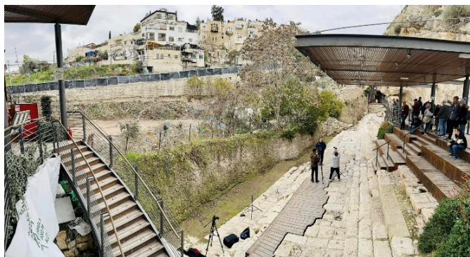
The recently discovered Pool of Siloam

Journey on foot to the bottom of the ancient City of David and visit the Pool of Siloam where Jesus sent the man who was born blind to wash his eyes to be healed (John 9). You may even choose to walk through King Hezekiah's tunnel to get there!